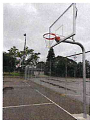
Newly updated basketball hoops in Pigeon Village Park.

Pigeon, in the midst of closure of gyms and cancellation of youth activities due to coronavirus, wanted to ensure that their young people had resources. Through a partnership with Apple Blossom Wind, HCCF's Pigeon Community Fund provided $10,000 in grant support to overhaul the basketball courts and hoops at the Village Park. Providing funds to revitalize this existing community asset increased its use, especially when other activities were unavailable to the community.