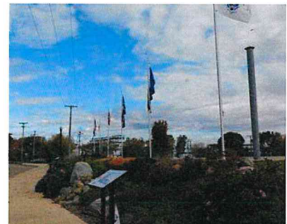
The completed Flagpole Project, featuring the Veterans Memorial Garden and Heroes Project in Harbor Beach.

In Harbor Beach, American Legion Post 197 embarked on a project to honor fallen soldiers from Harbor Beach and all those who served with their Heroes Project, Veterans Memorial Garden, and Flagpole Project. HCCF provided a $2,500 grant to complete the $4,700 Flagpole Project, the final phase of the project for the group. Located near the water in Harbor Beach, the project turned a standard flower bed into a meaningful addition to the community. The project was a true community effort, as it was funded by private contributions, a partnership with the City, and grant dollars.