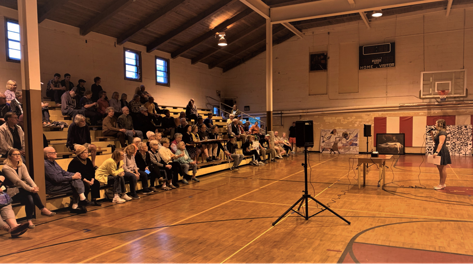
Over 80 community members attended the Placemaking Pitch Event, hosted in the Port Austin Gymnasium, on May 16th. These community members heard one minute or less "pitches" from each organization. After the presentations, the community in attendance voted for their favorite project from any particular region. The Pitch Event votes played a large role in the award winners.

Additionally, a private donor funded another Placemaking Grant submission after seeing the project posted and shared during the Community Voice voting on Facebook. The Harbor Beach Middle School Library was created in part through a donation to the Community Impact Fund at HCCF. Because these projects were submitted by community member, shared on Facebook, pitched to community members, and then voted on again, they received more publicity than our traditional grants. Altogether, over eight projects that were pitched during this grant ground came to life in 2019 thanks to public support.