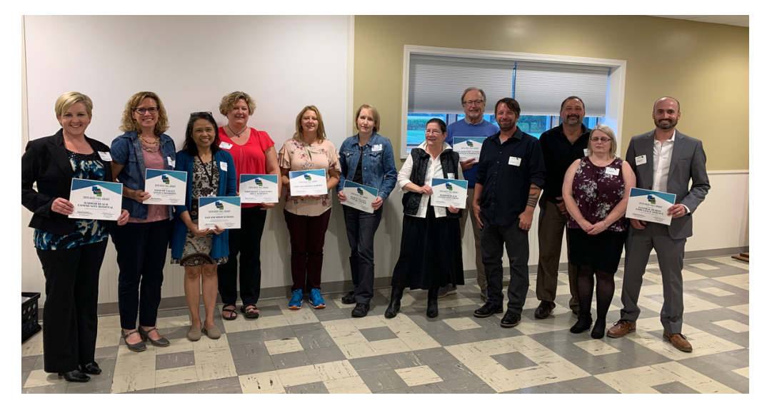
2019 Fall Grant Recipients pose for a group photo following the grant presentation at the HCCF Annual Celebration hosted at the Pigeon Event Center in September 2019.

Over $101,000 in grants were awarded to over 40 deserving organizations in 2019. This number includes our Placemaking Grants, highlighted earlier in the report, as well as grants from Designated and Donor Advised Funds. Our competitive grant awards, from our field of interest funds, were awarded at our Annual Celebration in September.